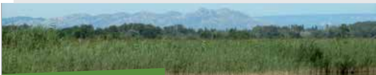
The Capeau swamps